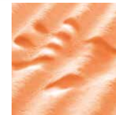
Memory std® is an innovative viscoelastic foam.

The Memory std® element with exclusive wave surface and seven variable patterns provides the correct support of the entire body.