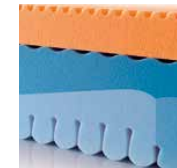
Shoulder area designed to allow a pleasant accommodation of shoulder and arm to avoid unpleasant numbness.