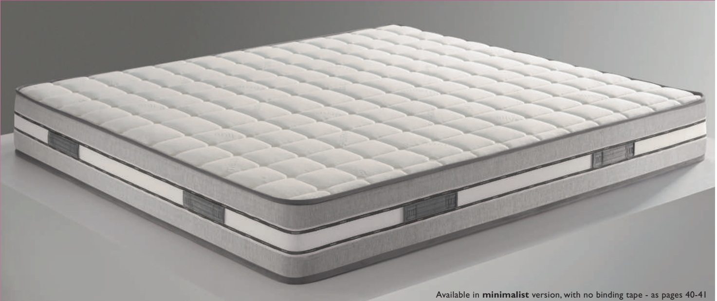
Available in minimalist version, with no binding tape - as pages 40-41

Ergonomic hypo-allergenic mattress with removable cover