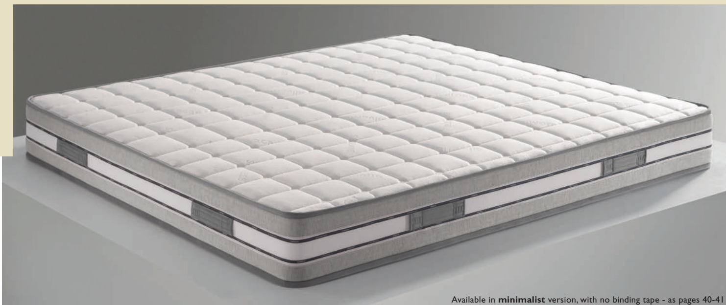
Available in minimalist version, with no binding tape - as pages 40-41

Ergonomic hypo-allergenic eco-friendly mattress with removable cover