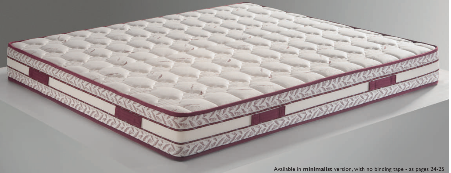
Available in minimalist version, with no binding tape - as pages 24-25

Ergonomic seasonal mattress with removable cover