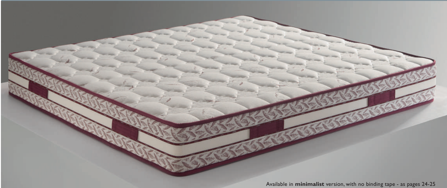
Available in minimalist version, with no binding tape - as pages 24-25

This mattress is suitable for those who do not feel particularly hot or cold in bed, have mild sweating, are overweight (exceed their ideal weight by 5/10%), sleep on their side or in other positions (particularly suitable), wish to use an adjustable base , suffer from neck and/or back pain, have peripheral blood circulation issues, are not subject to electromagnetic pollution, want a mattress with differing comfort levels on either side (bi-comfort), want a different comfort level than their partner, have a particular need to remove the mattress cover.