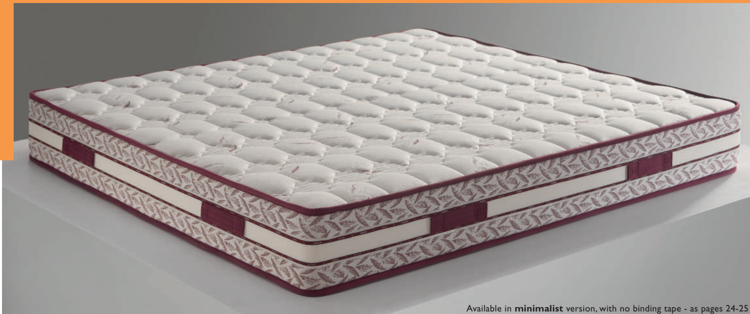
Available in minimalist version, with no binding tape - as pages 24-25

Orthopaedic seasonal mattress with removable cover