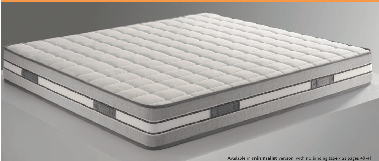
Available in minimalist version, with no binding tape - as pages 40-41

Ergonomic hypo-allergenic mattress with removable cover