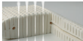
Respiro ® std latex Vertical pinholes and side perforations.